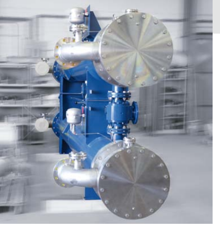
Double SWP with volume expansion tanks

In conventional technical solutions with double tubes, the outer tube has a relatively rough structure on its interior. FUNKE, however, shifts the structure to the outside of the inner tube and uses a finer structure in a pyramid shape.